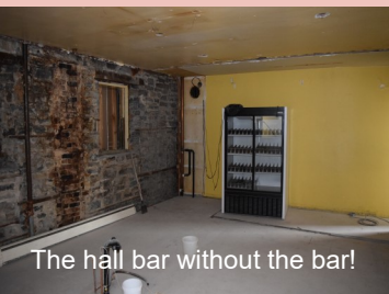
The hall bar without the bar!