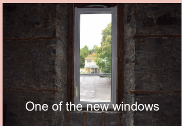
One of the new windows

transformation to the look and feel and of the hall. As you will see from the attached pictures there is still much work to be done. Exposure has revealed other essential replacements including the electrical wiring. All the work associated with removal of the paneling and restoration of the window